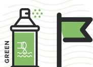
Sewer / Storm Drain