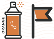
Communication / CATV