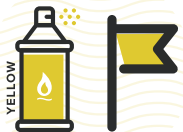
Gas, Oil, Steam