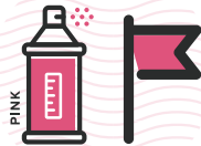
Temporary Survey Marking