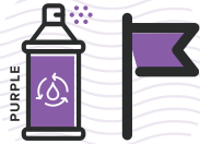
Reclaimed Water, Irrigation, Slurry